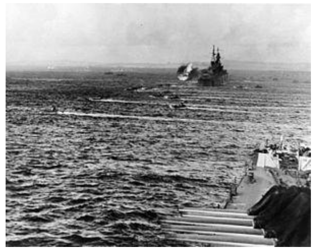
LVTs heading for shore on 15 June 1944. Birmingham in foreground; the cruiser firing in the distance is the Indianapolis .

• Jun 15 1965 – Vietnam: U.S. planes bomb targets in North Vietnam, but refrain from bombing Hanoi and the Soviet missile sites that surround the city. On June 17, two U.S. Navy jets downed two communist MiGs, and destroyed another enemy aircraft three days later. U.S. planes also dropped almost 3 million leaflets urging the North Vietnamese to get their leaders to end the war.