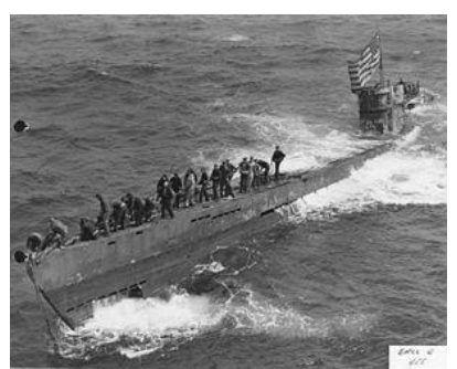
U-505 shortly after being captured