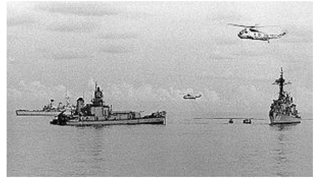
The stern section of USS Frank E. Evans on the morning after the collision.