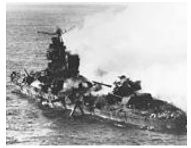
The sinking of Mikum