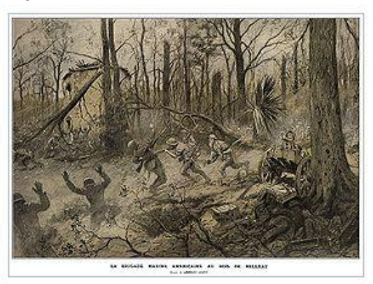
American Marines in Belleau Wood (1918)